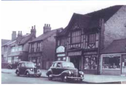
Answer on page 4