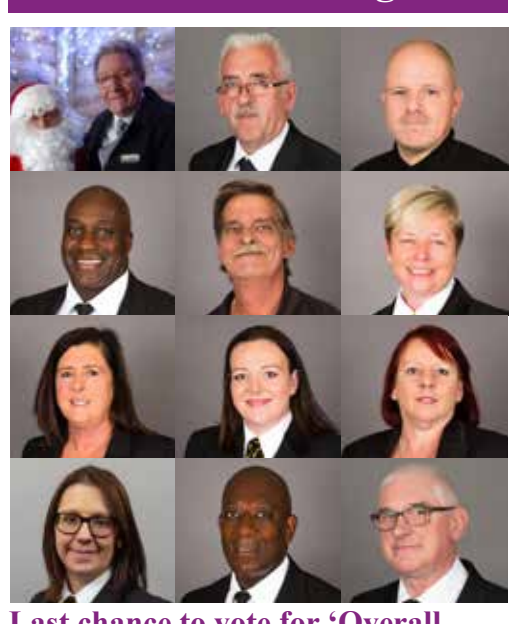
Last chance to vote for 'Overall Best Practice of the Month 2018' Back page